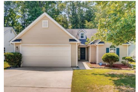
Choice Lease Home, Georgia

increase in residents' home purchase rate 3