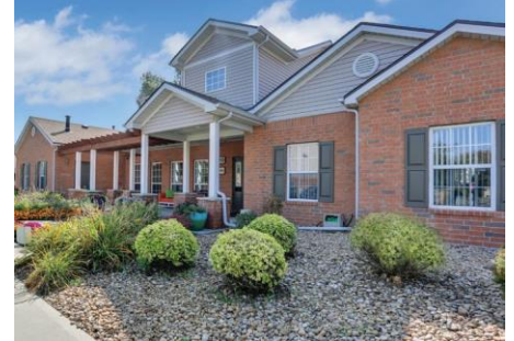
April Housing Community, Colorado

invested to develop nearly 800 new affordable housing units in Denver and Phoenix in partnership with Dominion