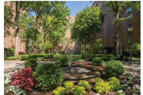
StuyTown, New York City

reduction in average work order completion time since 2015