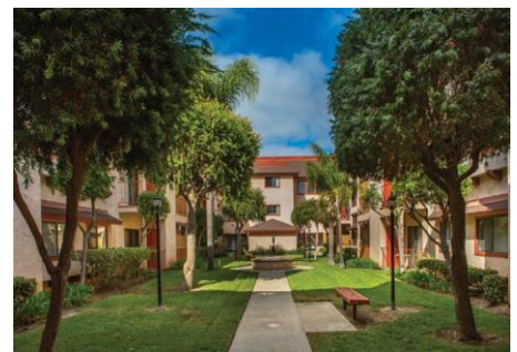
Residential Community, San Diego

30% increase in resident satisfaction since our ownership began 4