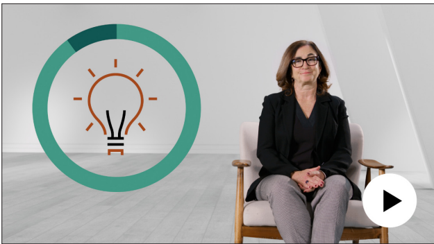
Three Tips for Introducing Private Markets

Short videos featuring Blackstone professionals sharing practical guidance.