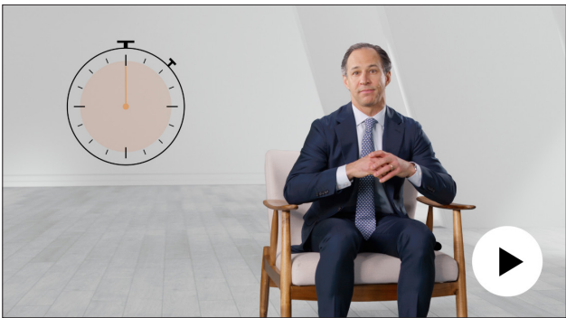
Getting the Job Done for Your Clients