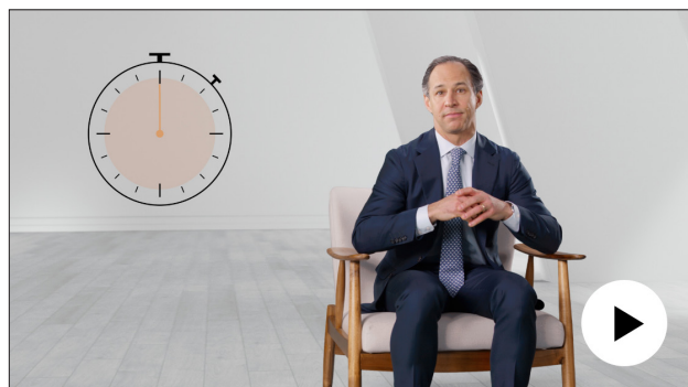
Getting the Job Done for Your Clients