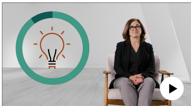
Three Tips for Introducing Private Markets

Short videos featuring Blackstone professionals sharing practical guidance.